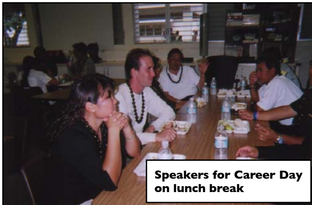
Speakers for Career Day on lunch break